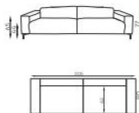
Giro Sofa 2,5 seater